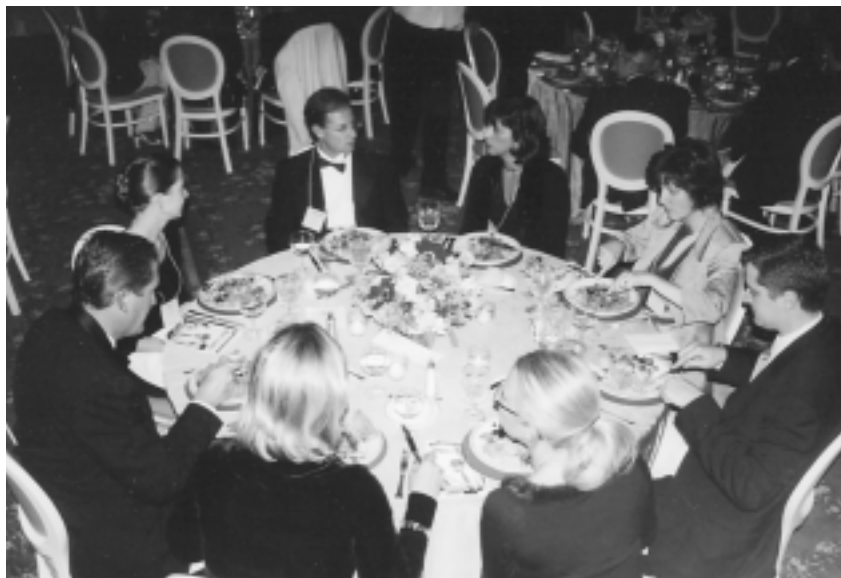
More than 150 NUCFB members, advisors and sponsors enjoyed an evening of celebration.