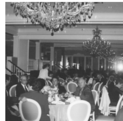
The Center's gala 10th Anniversary Celebration was held at the Pine Brook Country Club, Weston, in November.